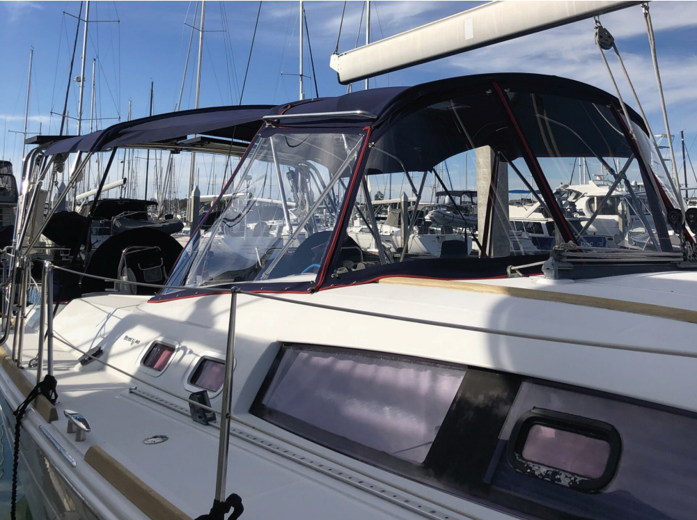
Sailboat Dodgers & Biminis

Main Fabric: Marine Blue Sunbrella Secondary Fabric: Jockey Red Sunbrella Window: TUFFAK AR2 Hardware/Findings: Flex-A-Rail PVC track Window: 40 gauge Strataglass