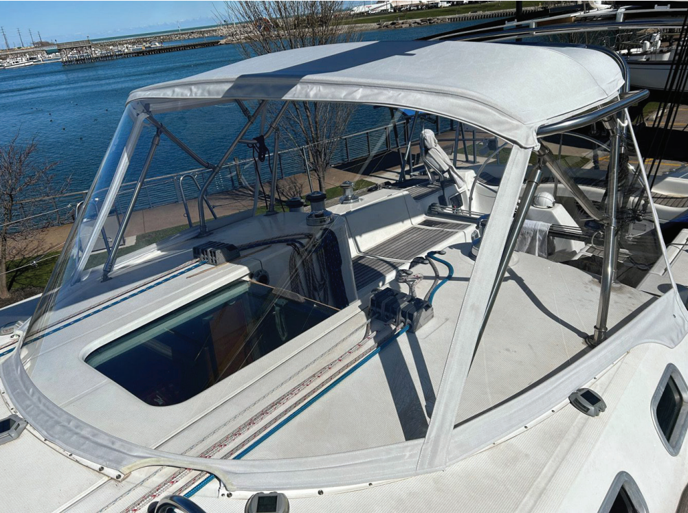
Sailboat Dodgers & Biminis

Main Fabric: Sunbrella, Glen Raven Custom Fabrics LLC Window: Aqua-Lite Polycarbonate, Manart-Hirsch Co. Inc. SolarFix PTFE Thread, Keystone Bros.