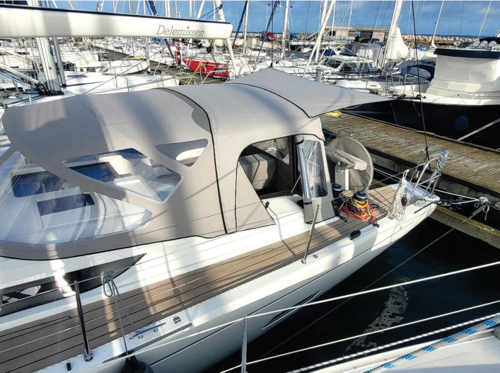
Sailboat Dodgers & Biminis