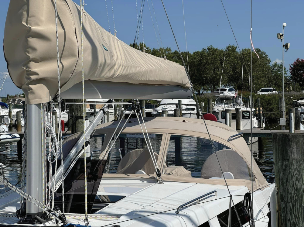
Sailboat Dodgers & Biminis

Main Fabric: Sunbrella Linen, Trivantage LLC Window: Tuffak Polycarbonate Hardware/Findings: YKK Zippers SolarFix Thread